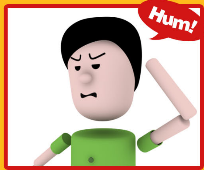
Some examples of facial expressions of the standard puppet